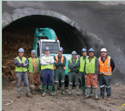
Then: First metre advanced underground at Dendrobium Mine, May 2002

This is a significant milestone, and we would like to thank the communities of Mount Kembla, Kembla Heights, Unanderra and surrounds for their ongoing support.