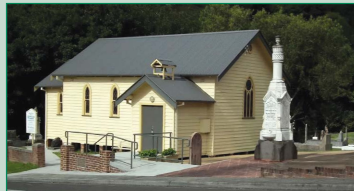
Mount Kembla Miners and Soldiers Church window restoration

Please contact us on 1800 102 210 or email illawarracommunity@south32.net to apply for funding or more information.