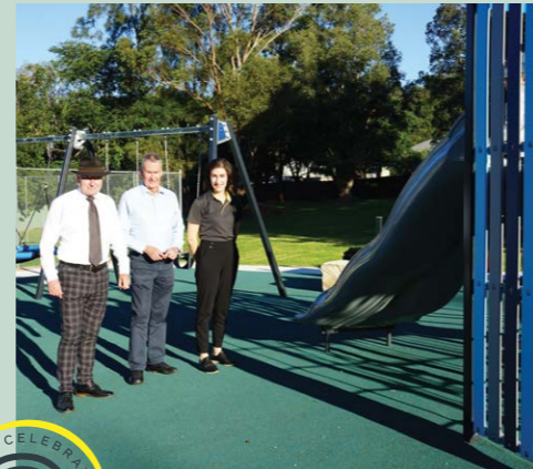
Now: Opening of a Dendrobium Community Enhancement Committee Project - Ryan Park Playground with Wollongong City Council